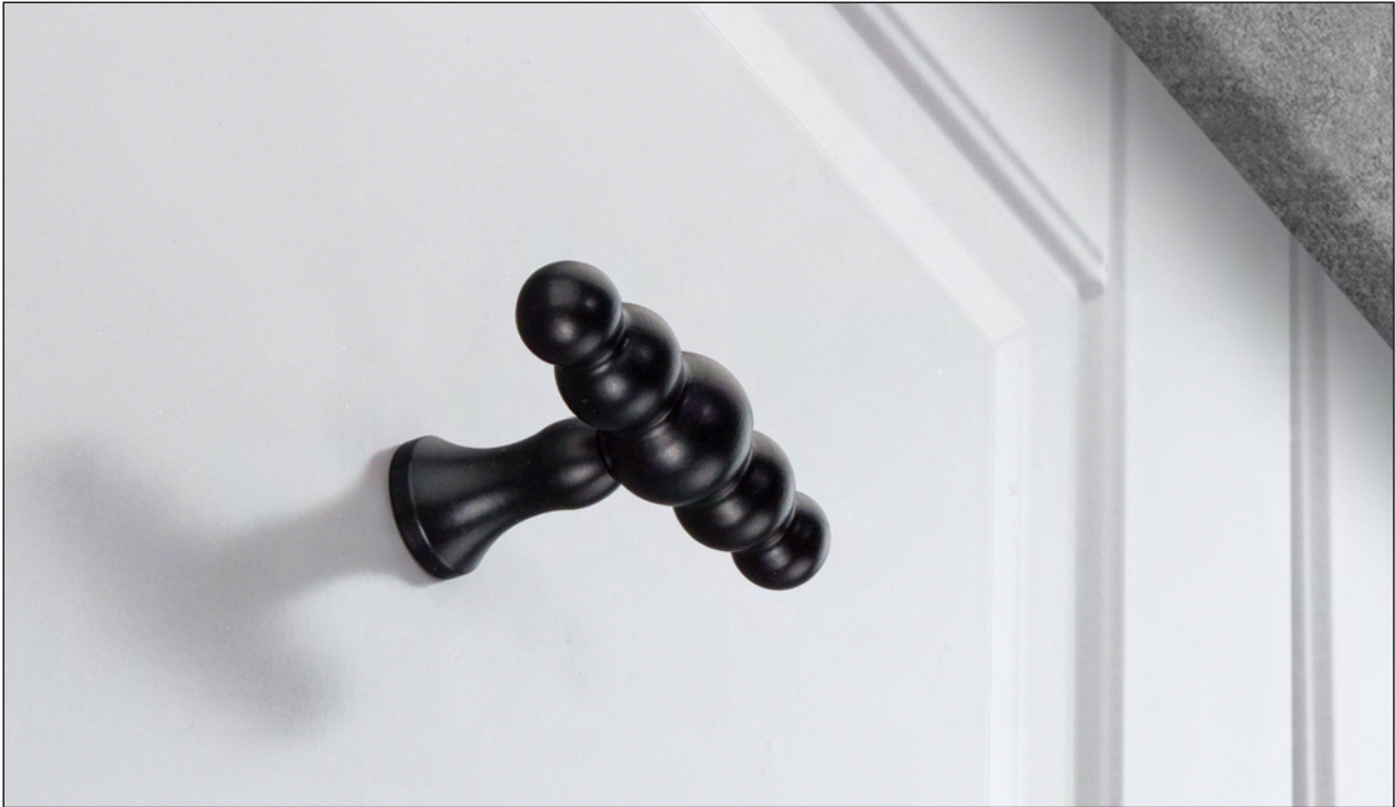
Matt Black (Finish ID:19)