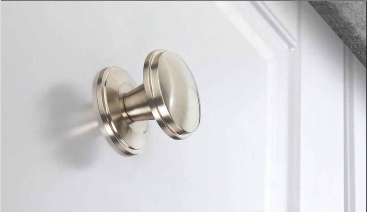
Brush Nickel (Finish ID:3)