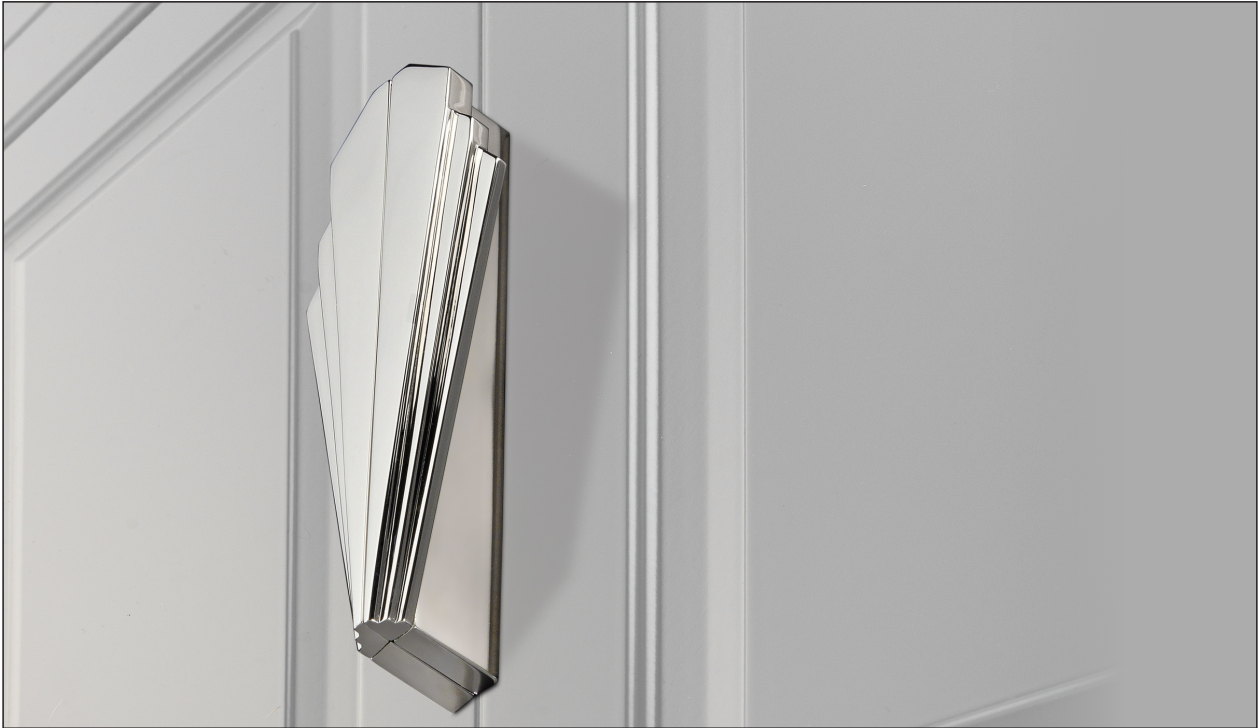
Polished Nickel (Finish ID:8)