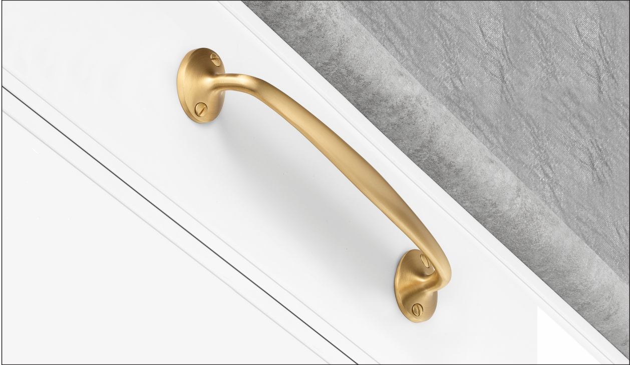
Satin Brass (Finish ID : 13)