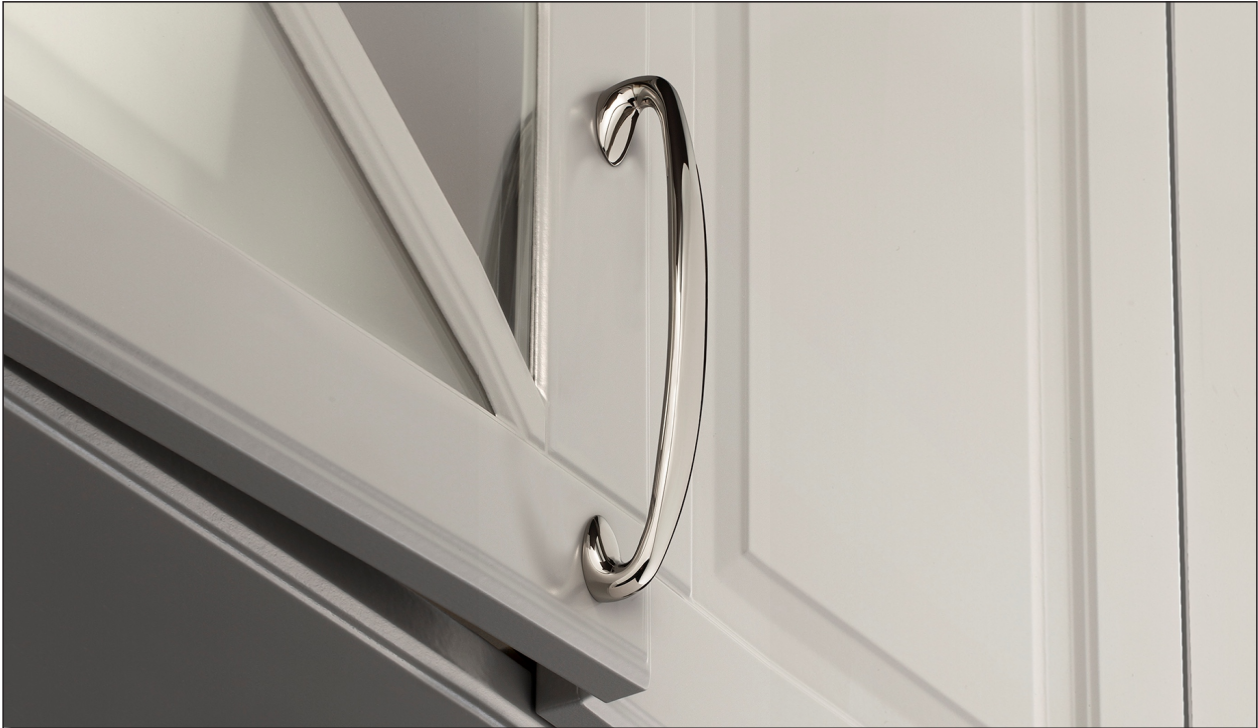
Polished Nickel (Finish ID : 8)