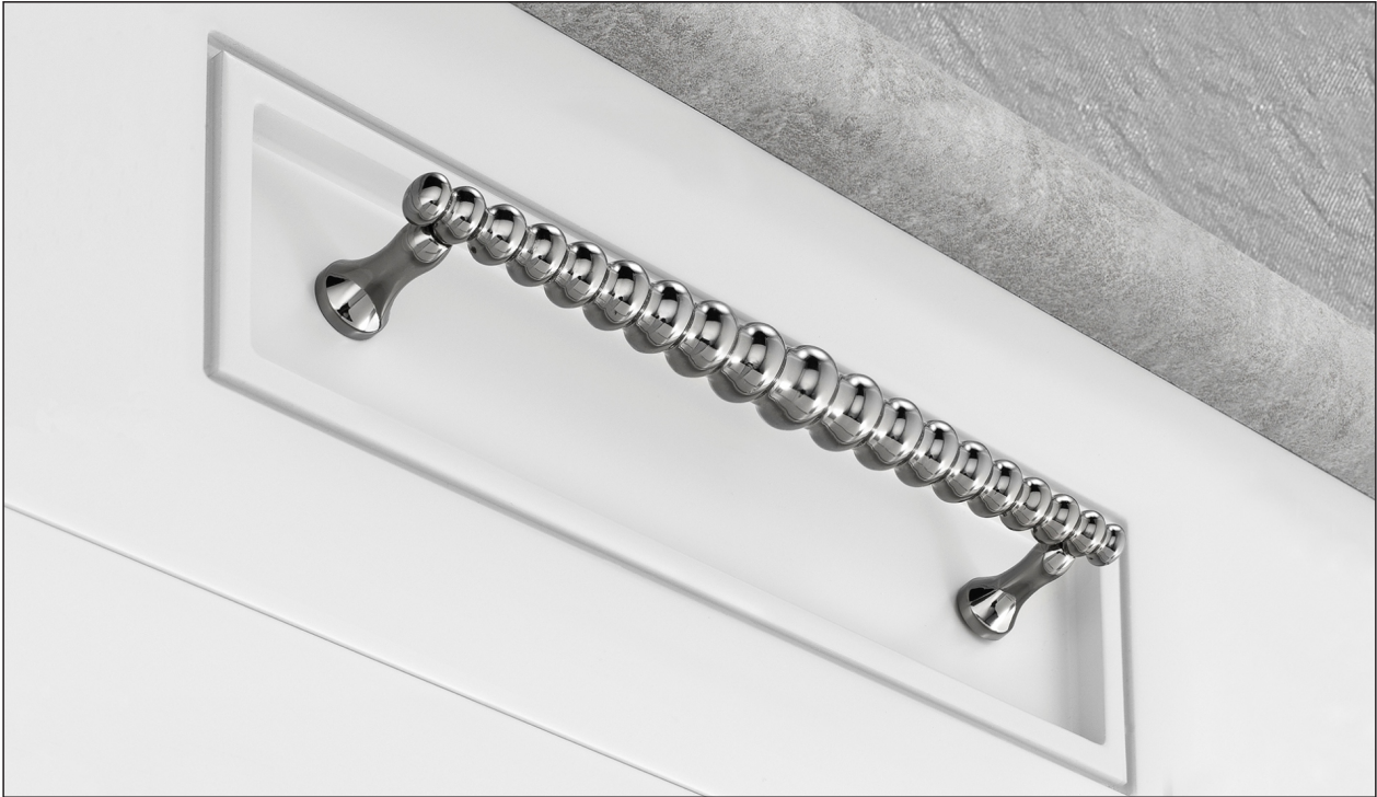
Titanium (Finish ID : 79)