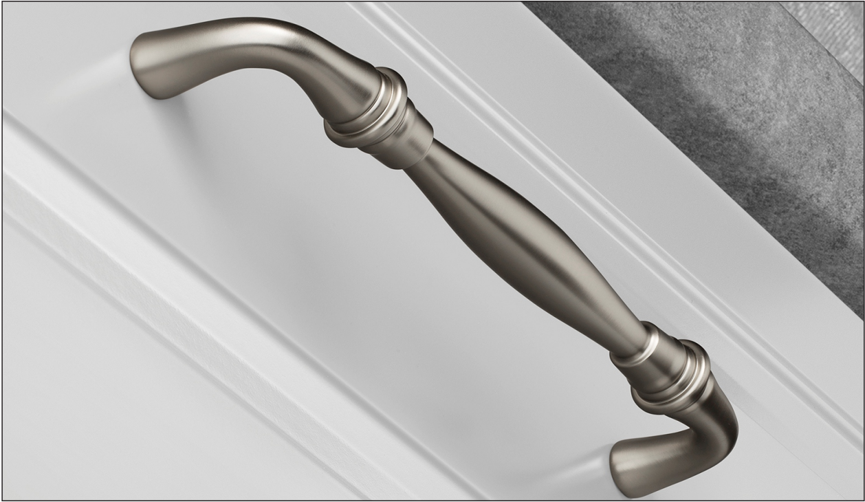
Brush Nickel (Finish ID : 3)