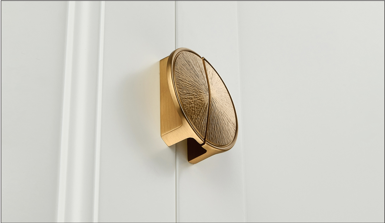
Satin Brass (Finish ID:13)