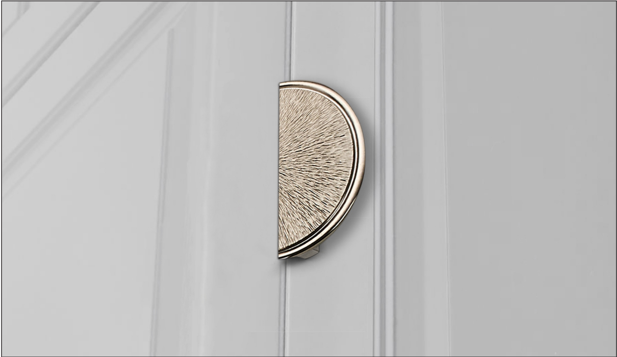
Polished Nickel (Finish ID:8)