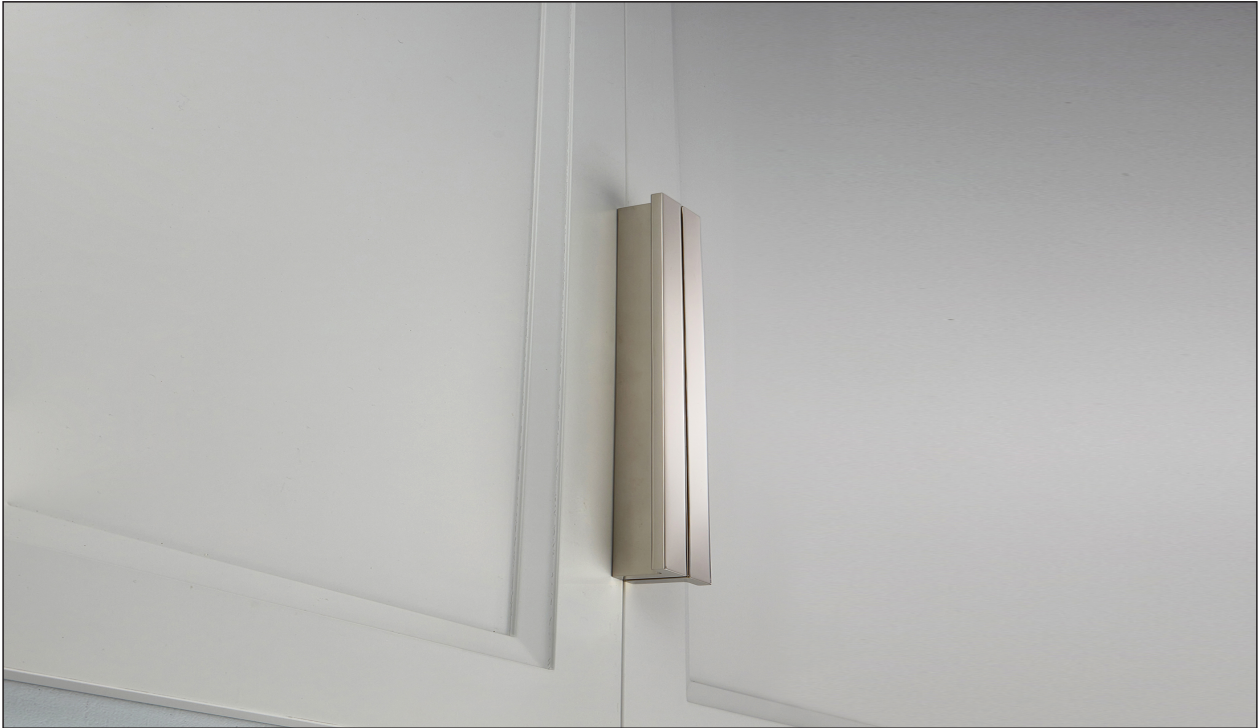
POLISHED NICKEL (Finish ID:8)