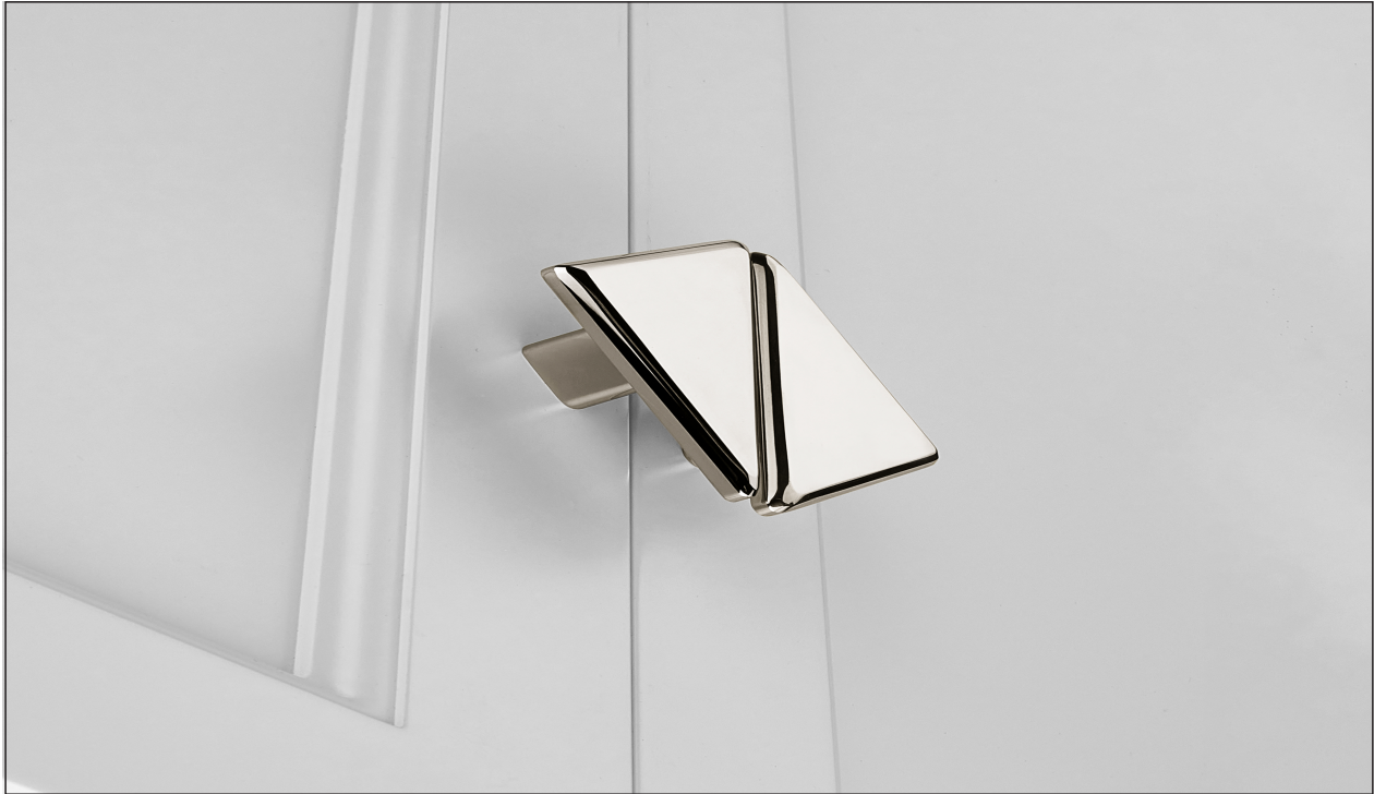
Polished Nickel (Finish ID:8)