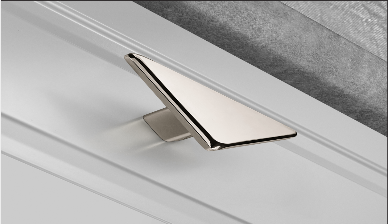
Polished Nickel (Finish ID:8)