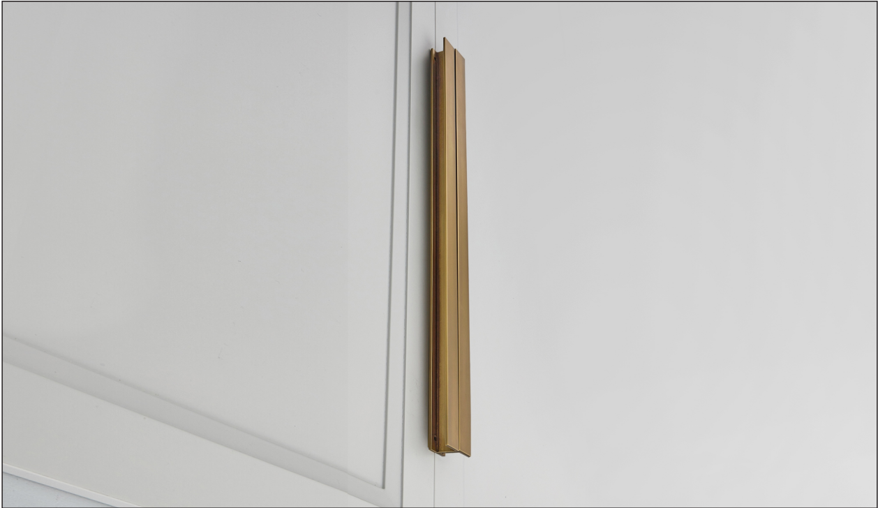
Aged Brass (Finish ID:4)