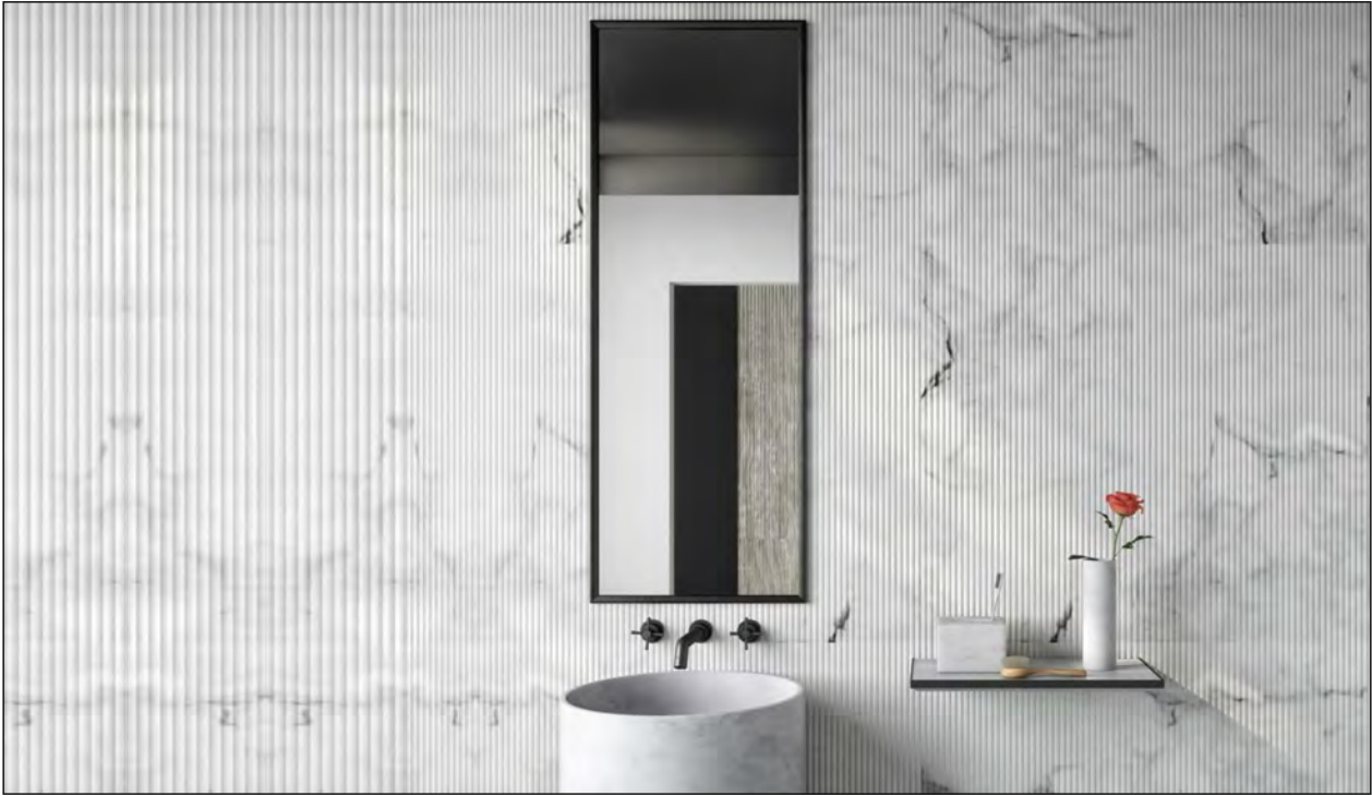
Matte Black (Finish ID:19)