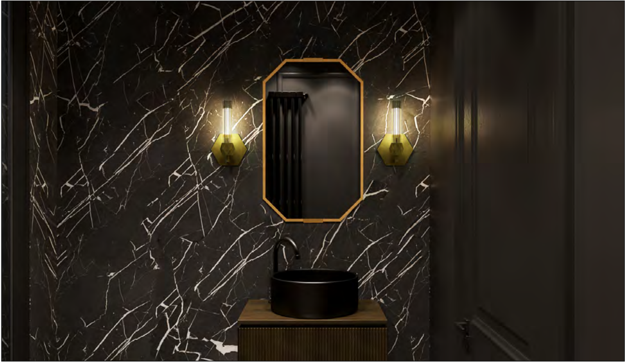
Satin Brass (Finish ID:13)