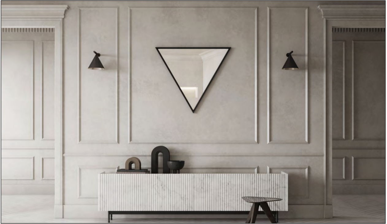
Matte Black (Finish ID:19)