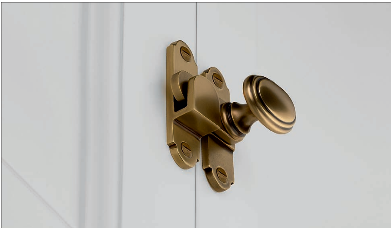
Aged Brass (Finish ID : 4)