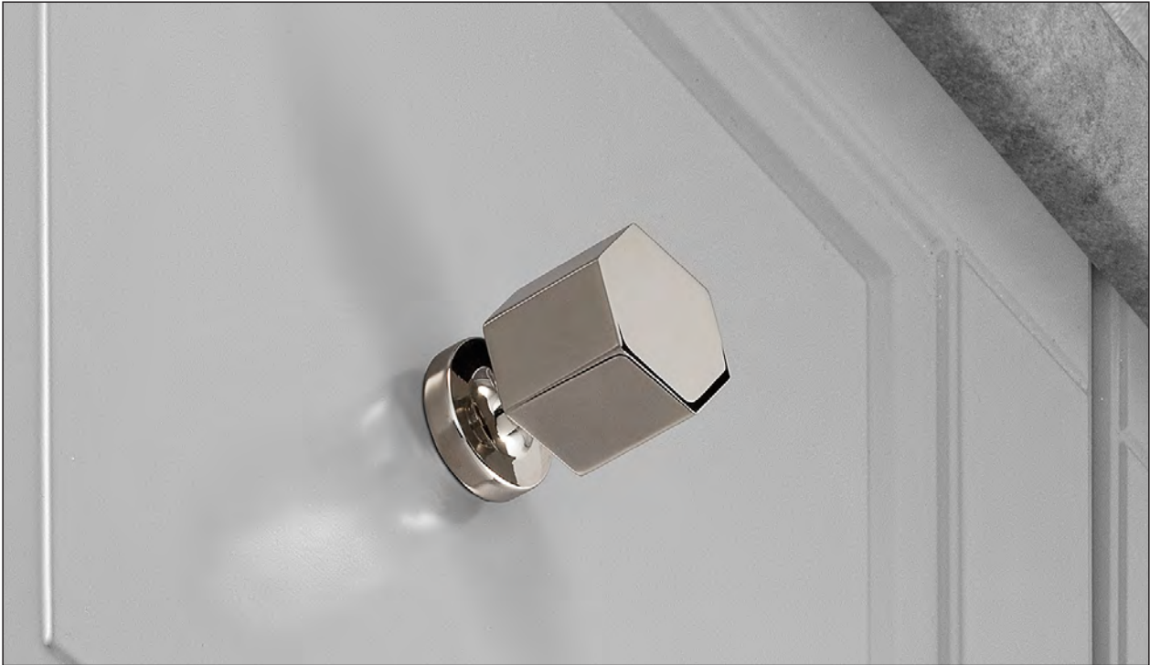
Polished Nickel (Finish ID : 8)