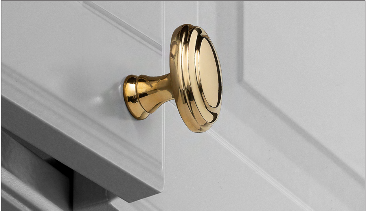
Unlacquered Polished Brass (Finish ID : 7U)