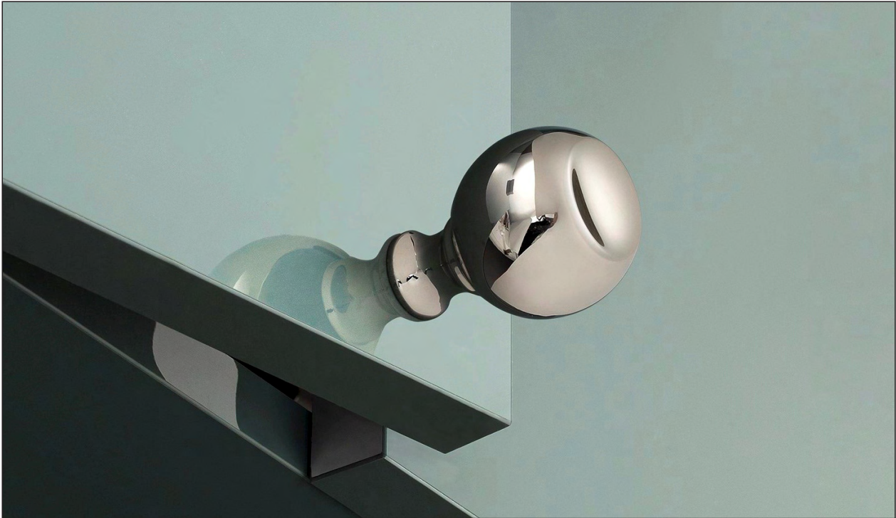
Polished Nickel (Finish ID : 8)