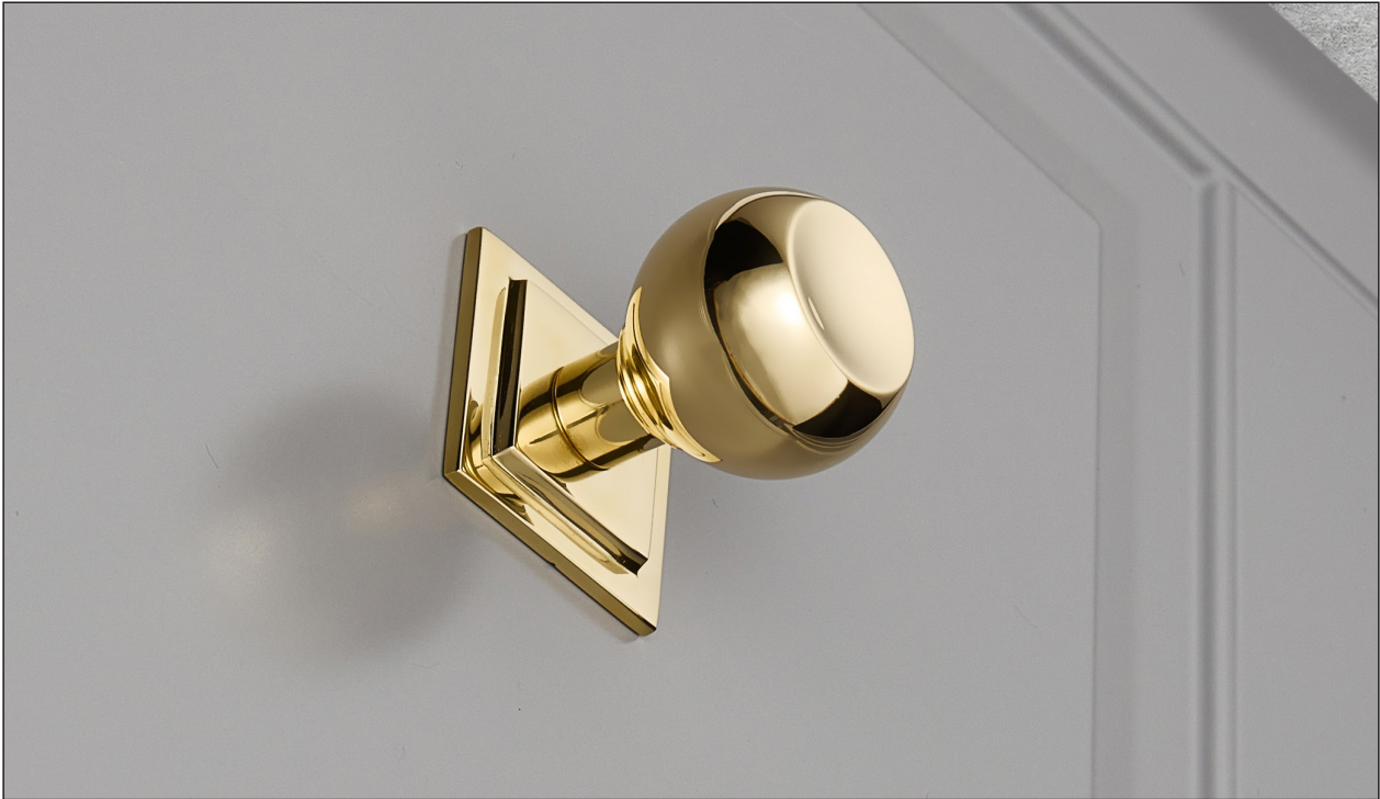
Unlacquered Polished Brass (Finish ID:7U)