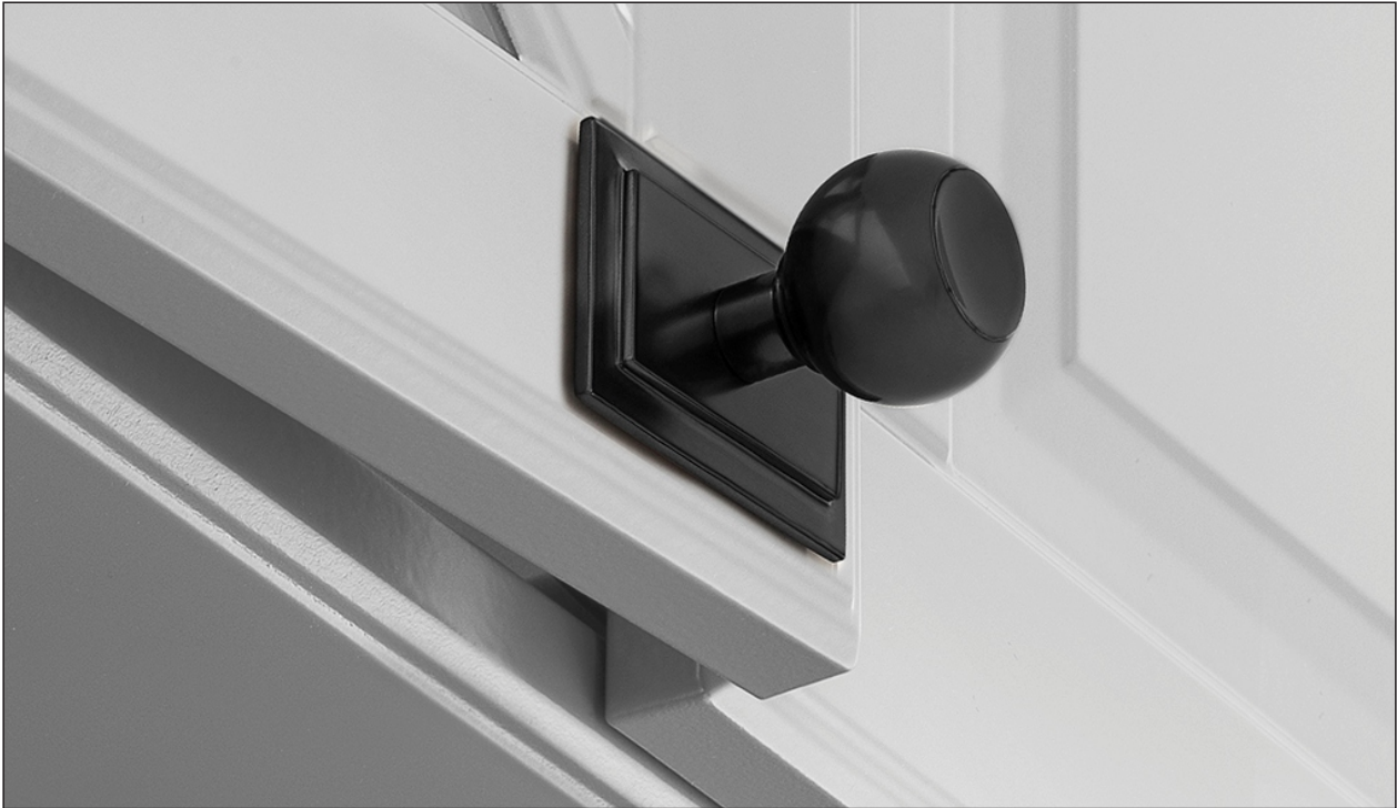
Matte Black (Finish ID : 19)