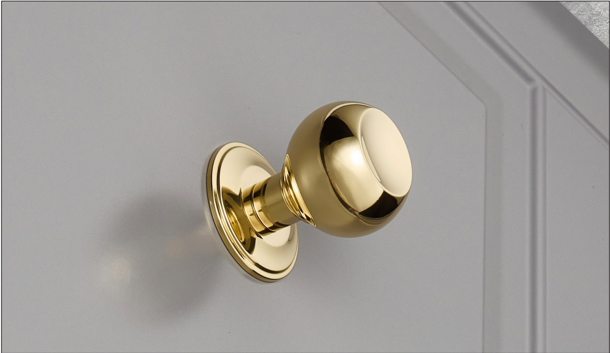
Unlacquered Polished Brass (Finish ID:7U)