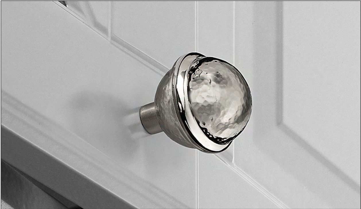
Hammered over Brush Nickel (Finish ID : 12-3)