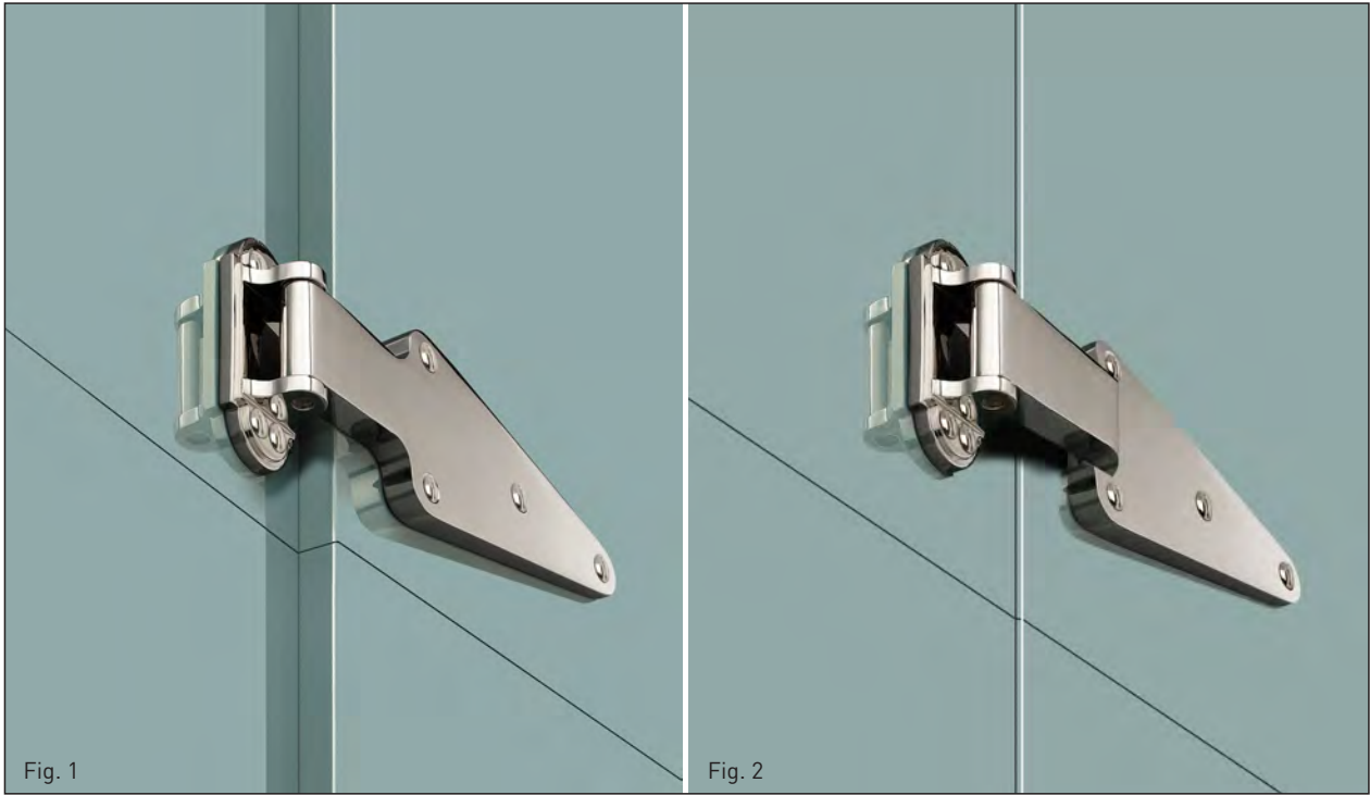
Polished Nickel (Finish ID : 8)