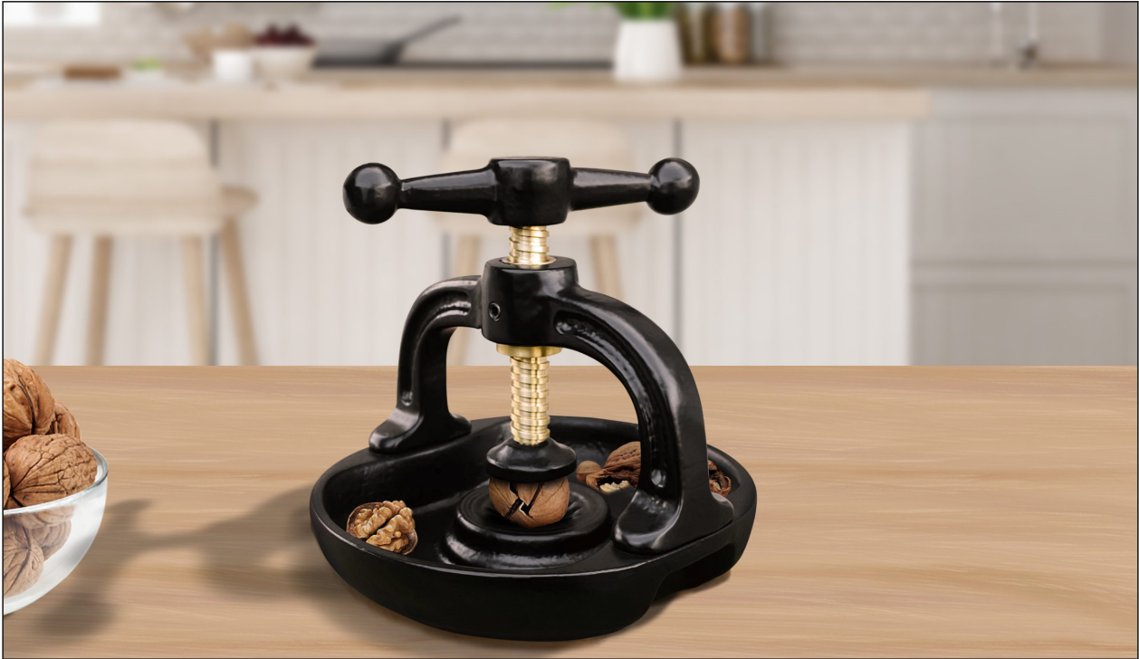
Matte Black (Finish ID:19)