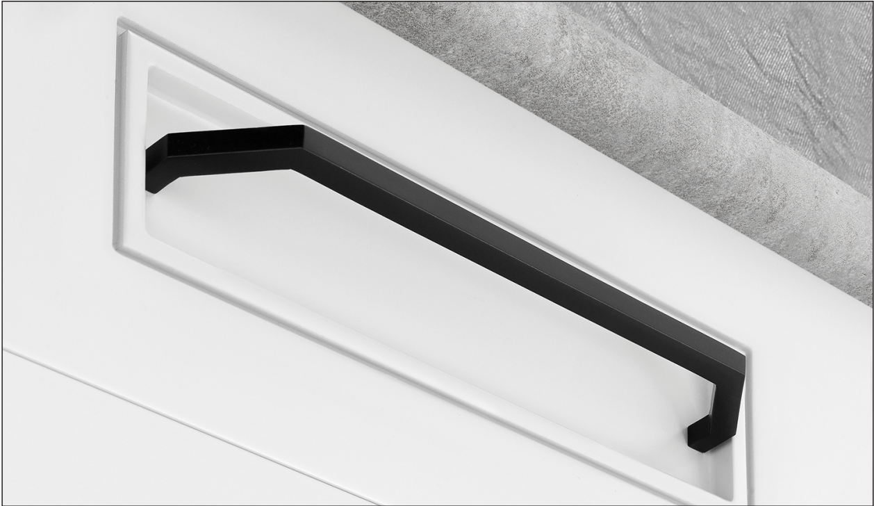
Matte Black (Finish ID : 19)