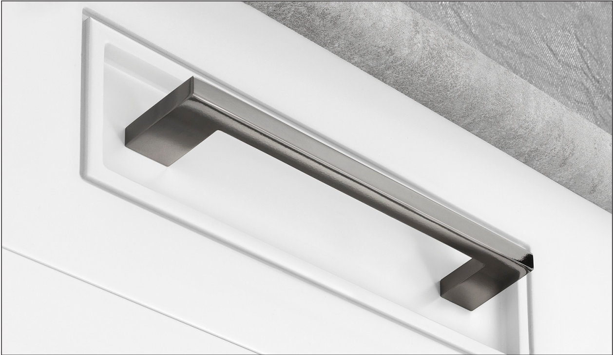
Titanium (Finish ID : 79)