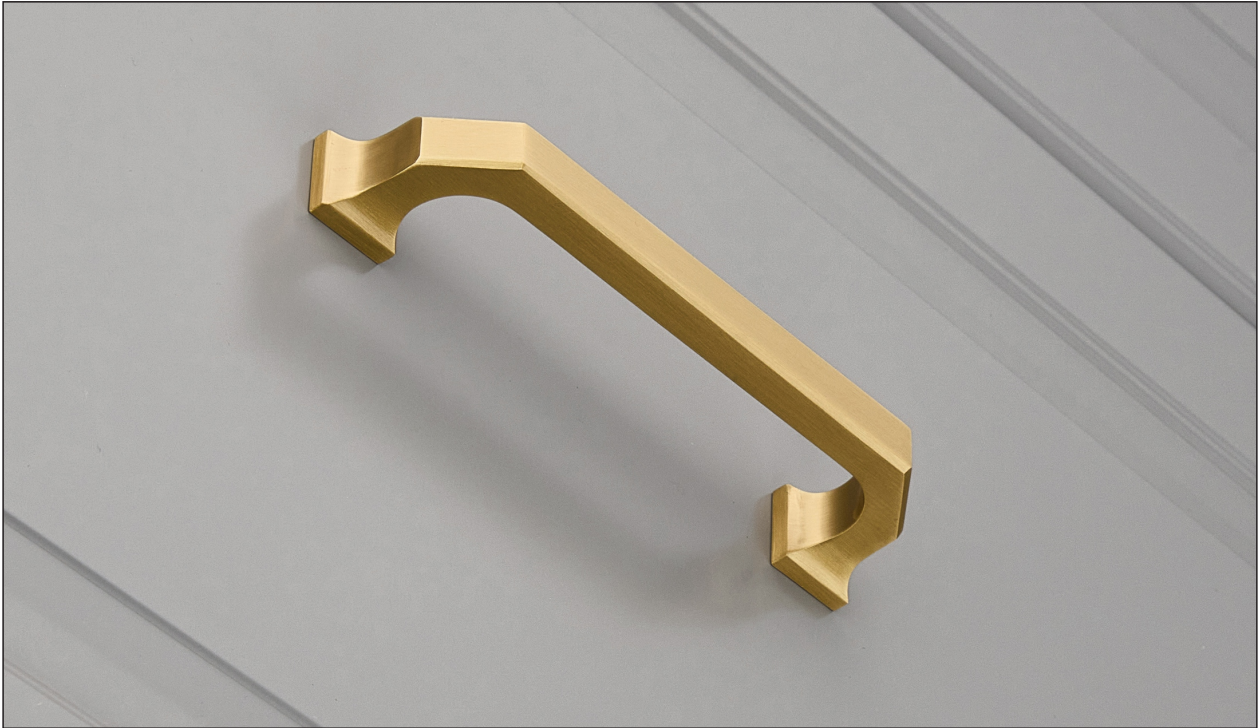
Satin Brass (Finish ID:13)