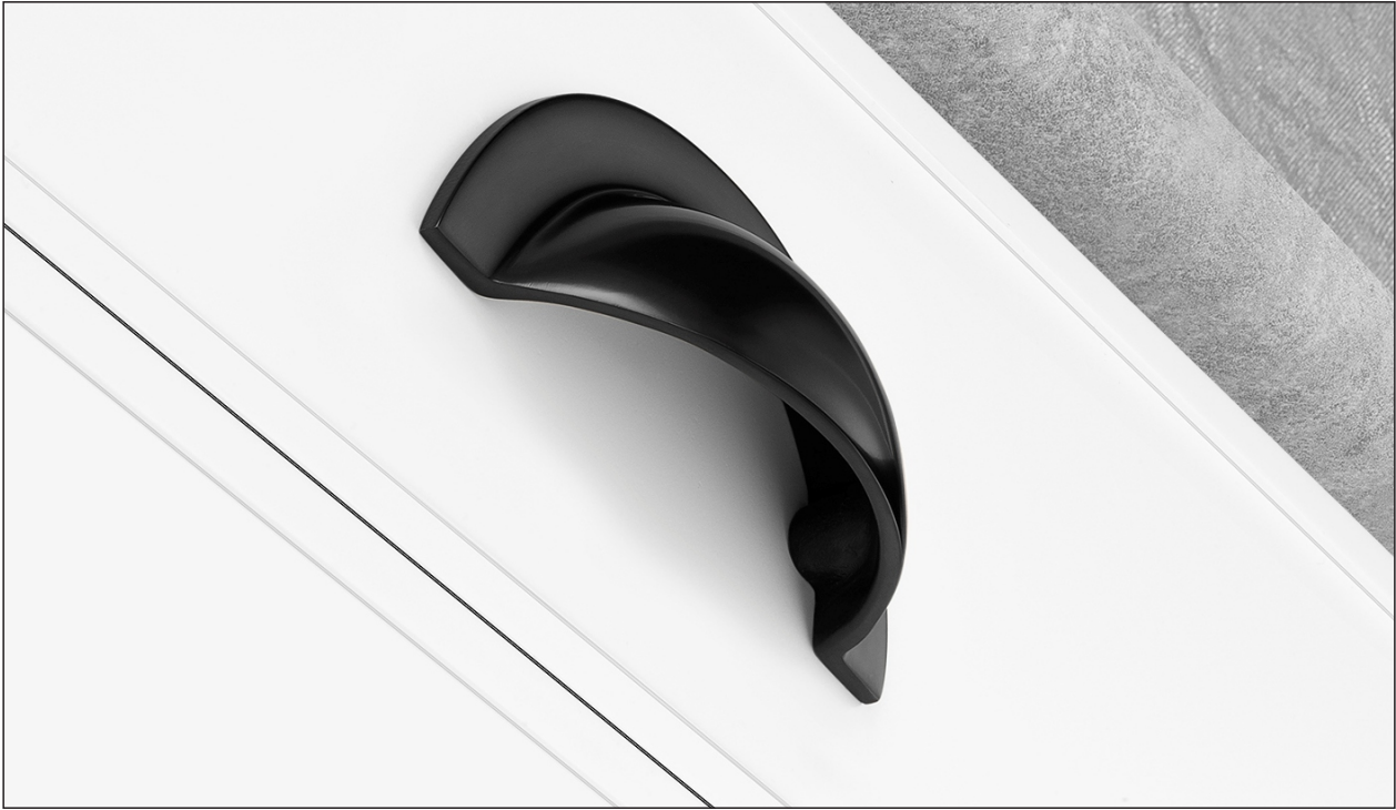
Matte Black (Finish ID:19)