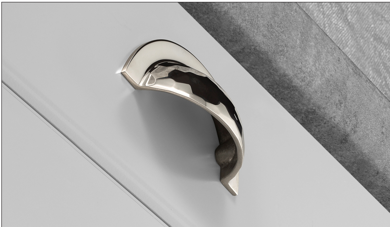
Polished Nickel (Finish ID : 8)