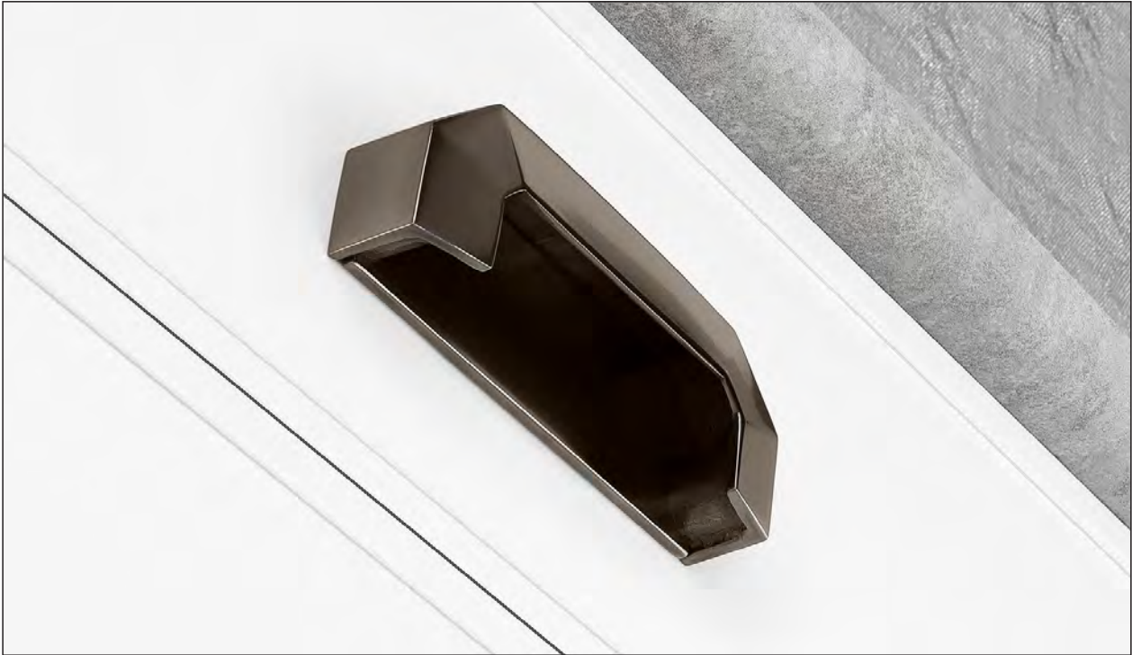
English Metallic Bronze (Finish ID : 51)