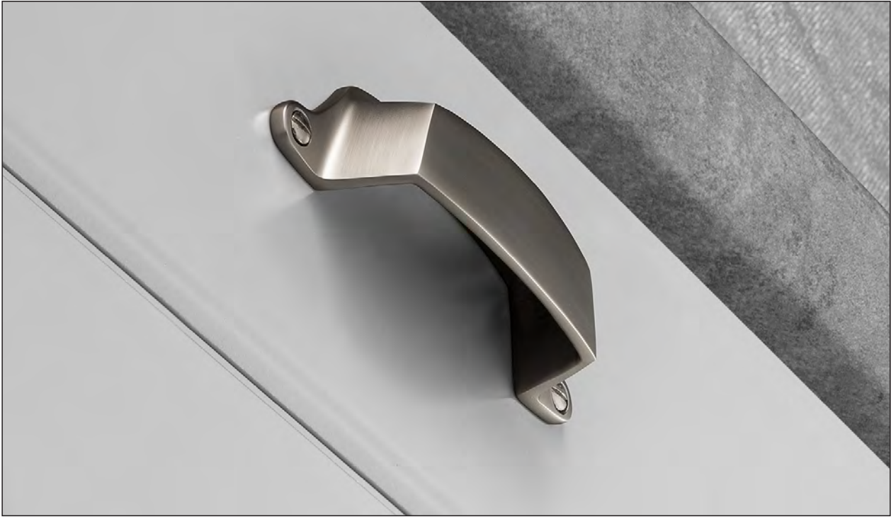
Brush Nickel (Finish ID : 3)