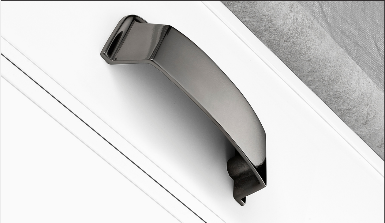
Titanium (Finish ID : 79)