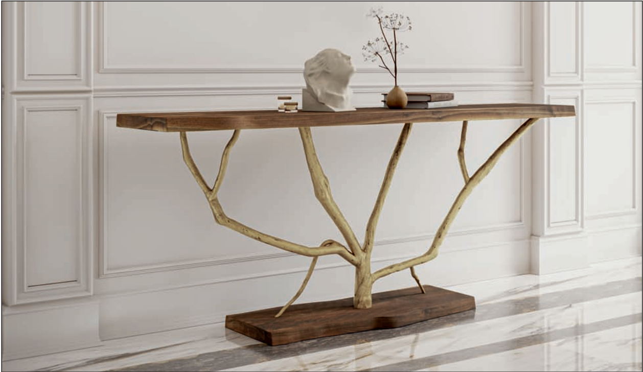
Satin Brass (Finish ID:13)