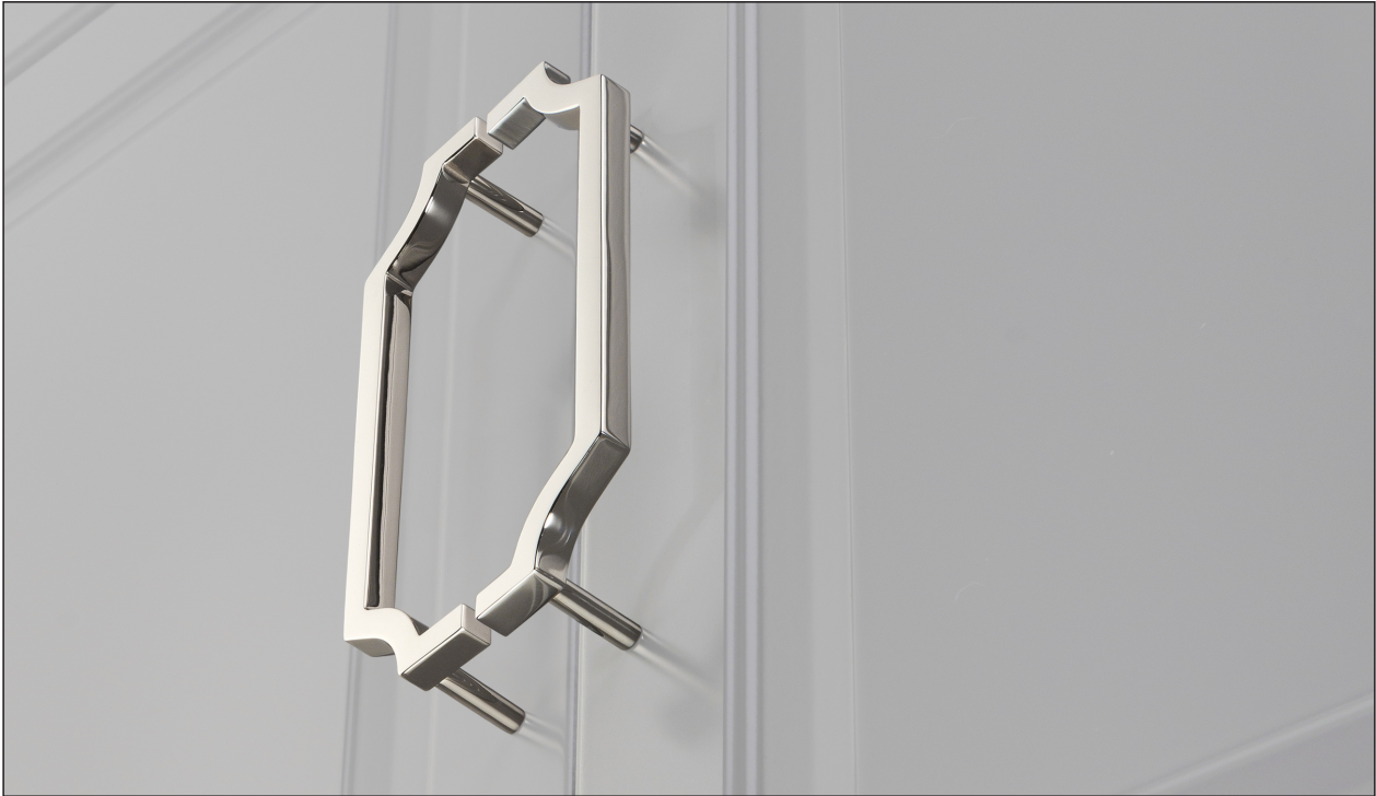
Polished Nickel (Finish ID:8)