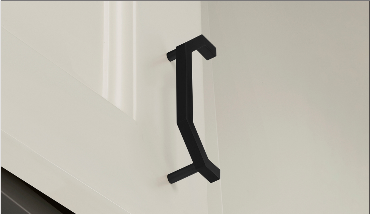
Matte Black (Finish ID:19)