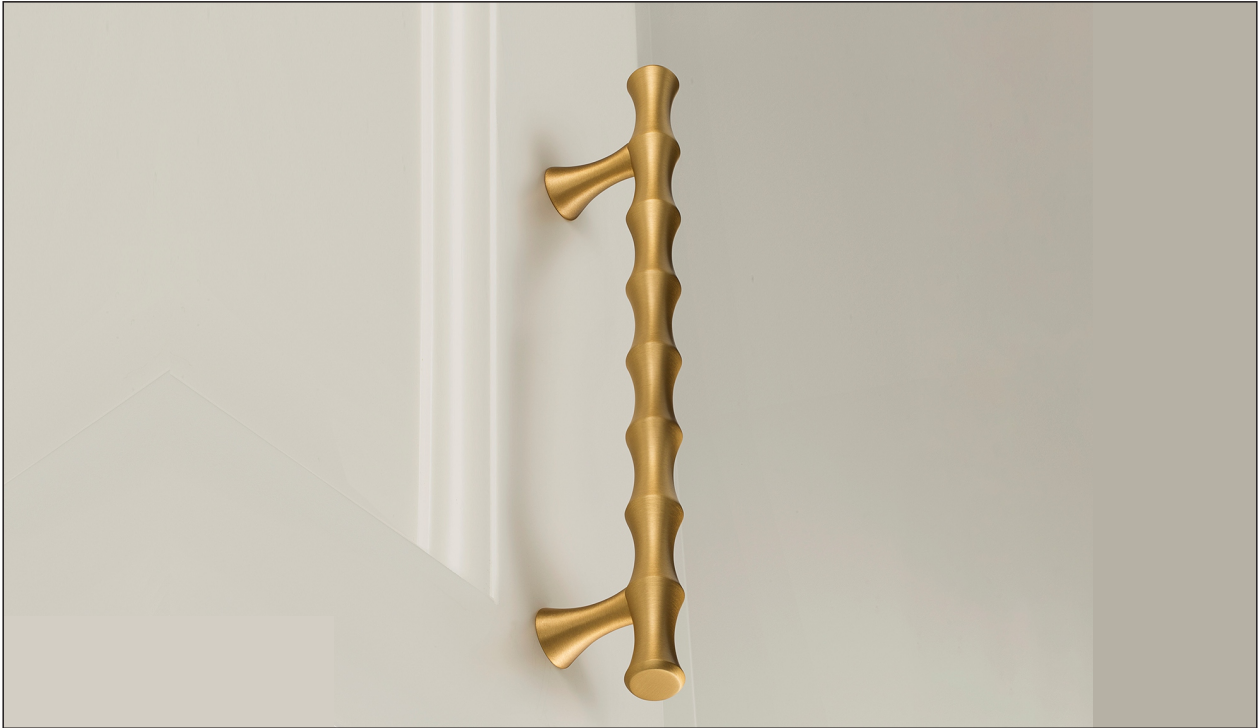
Satin Brass (Finish ID : 13)