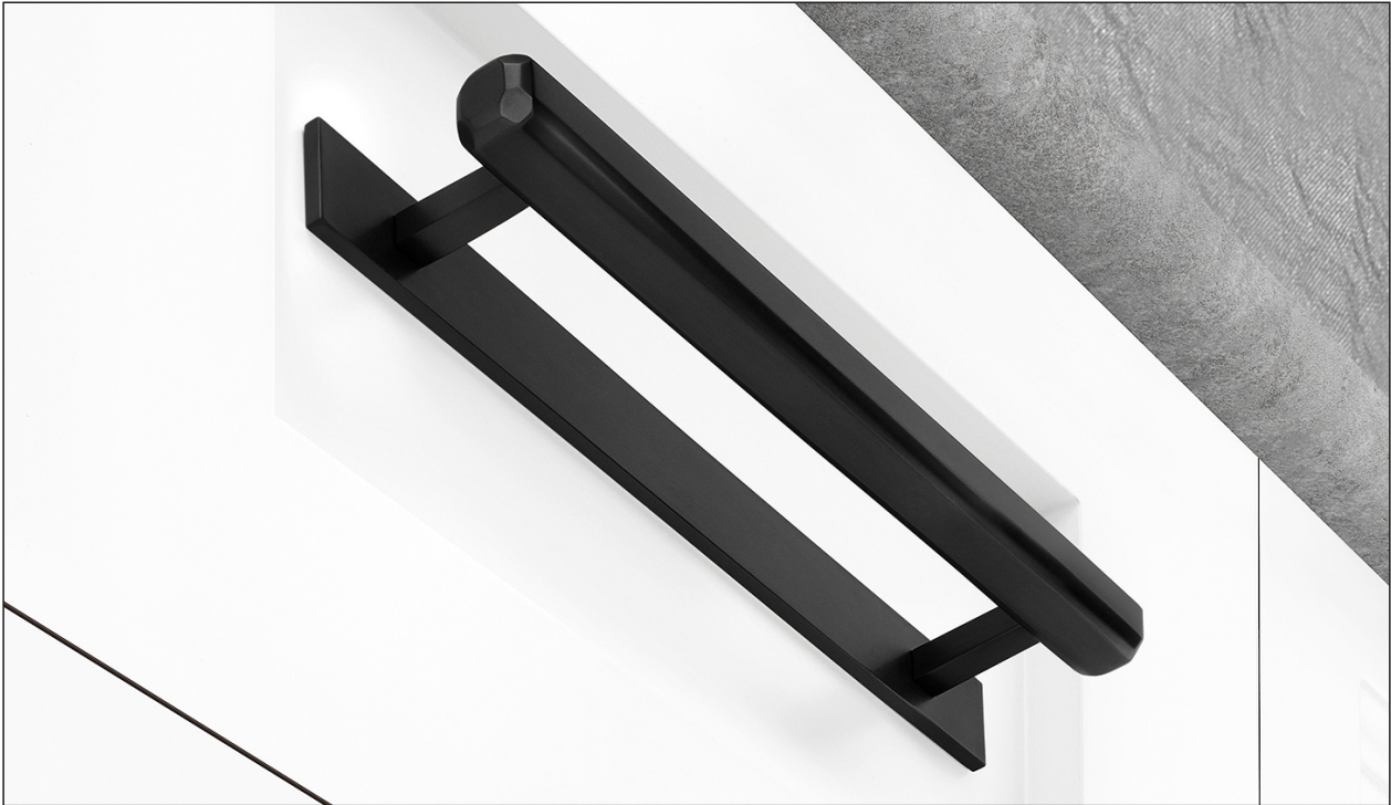
Matte Black (Finish ID:19)