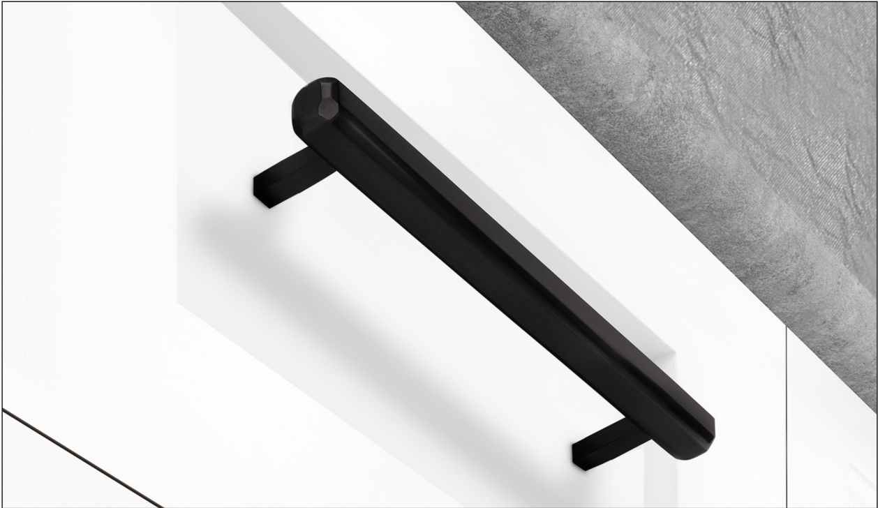
Matte Black (Finish ID : 19)