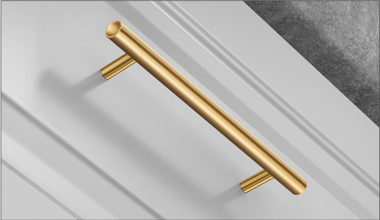
Satin Brass (Finish ID : 13)