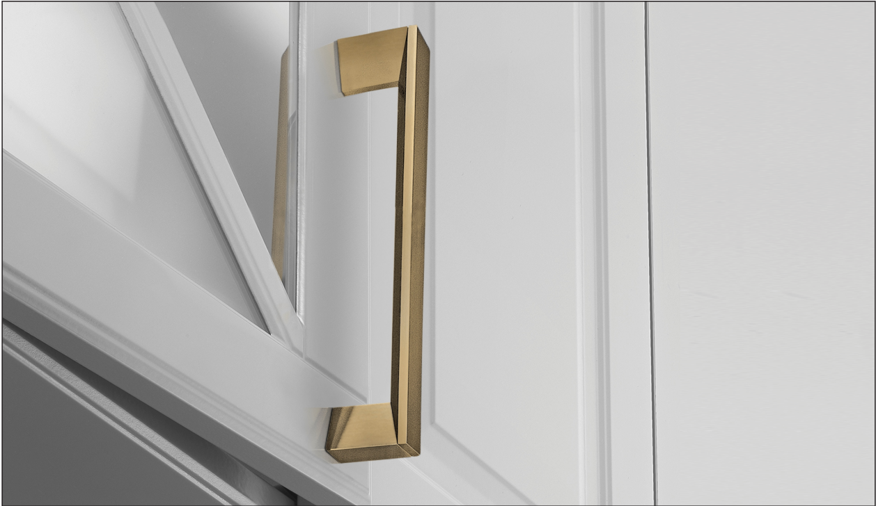
Aged Brass (Finish ID:4)