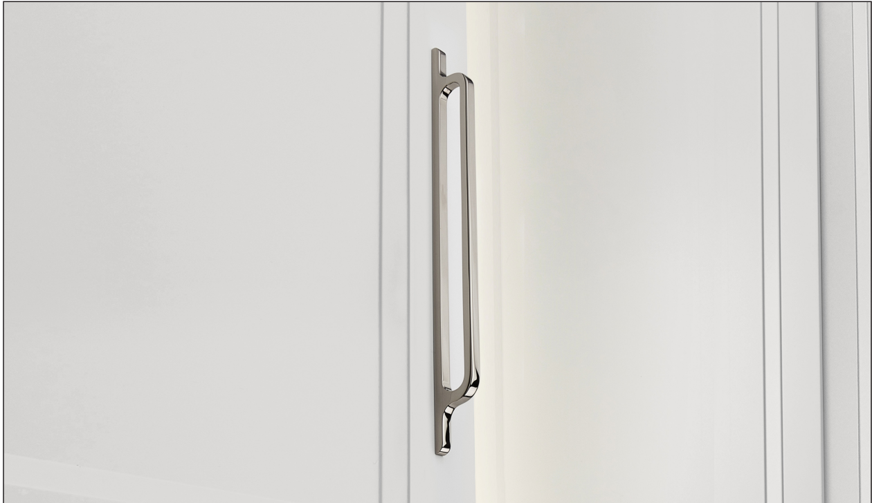
Polished Nickel (Finish ID:8)