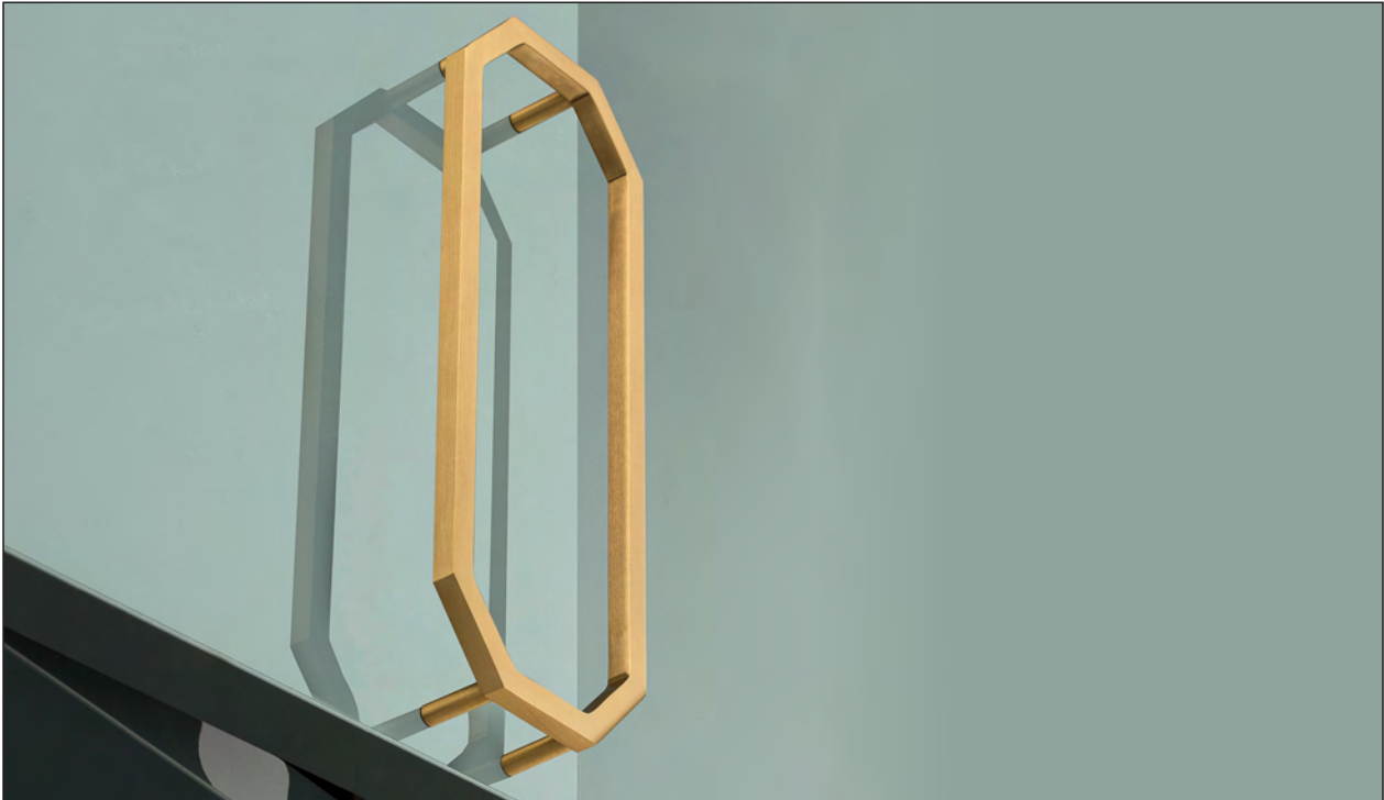
Satin Brass (Finish ID : 13)