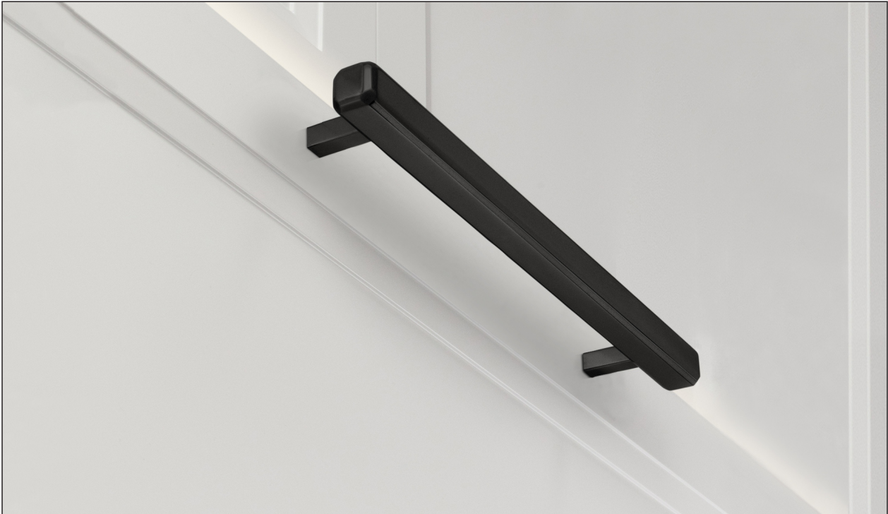
Matte Black (Finish ID:19)