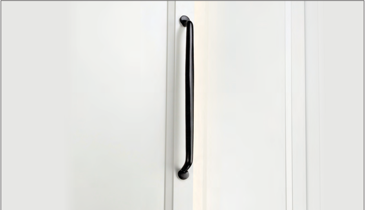
Matt Black (Finish ID:19)