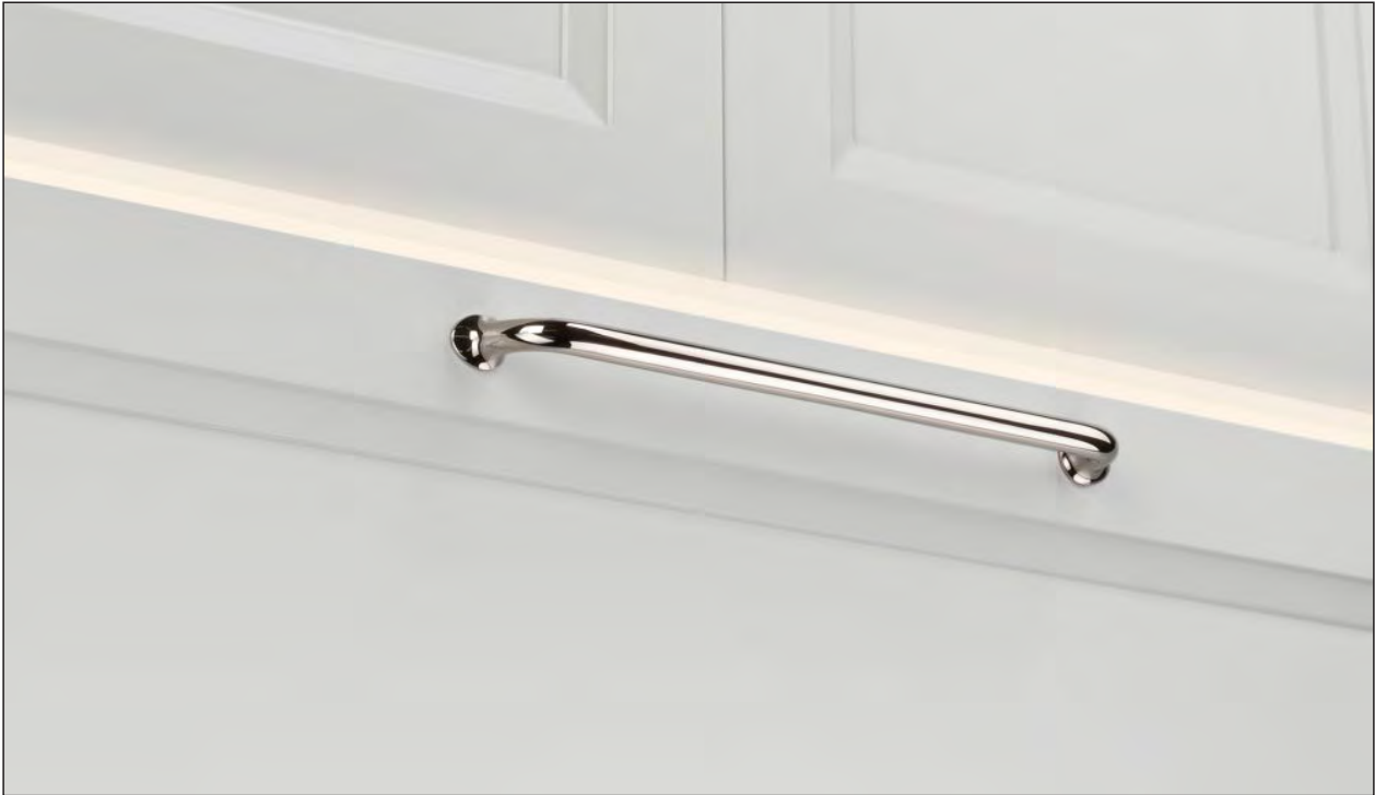
Polished Nickel (Finish ID : 8)