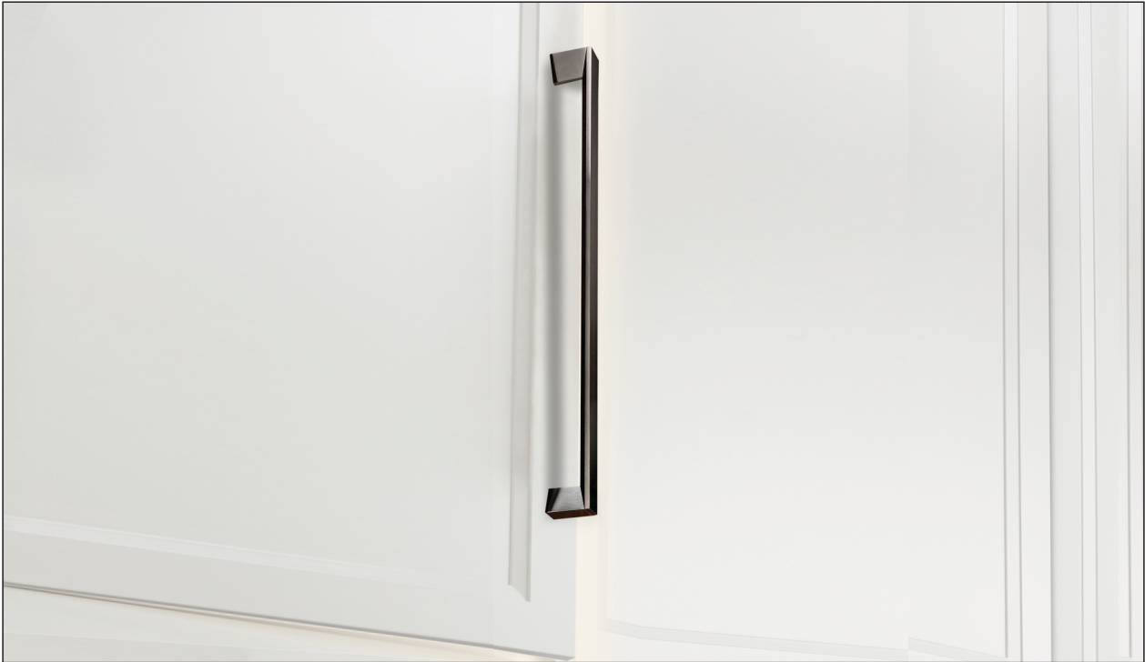
Graphite (Finish ID:61)