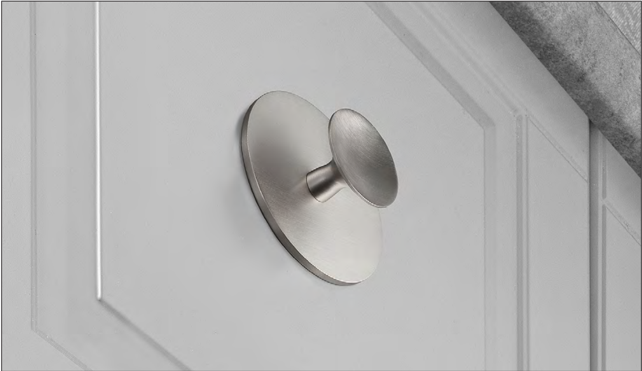
Brush Nickel (Finish ID : 3)